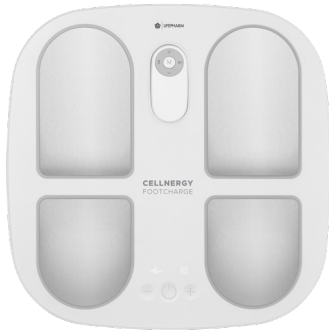
Cellnergy FootCharge Device