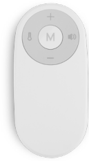
Remote Control (CR2032 Battery Installed)